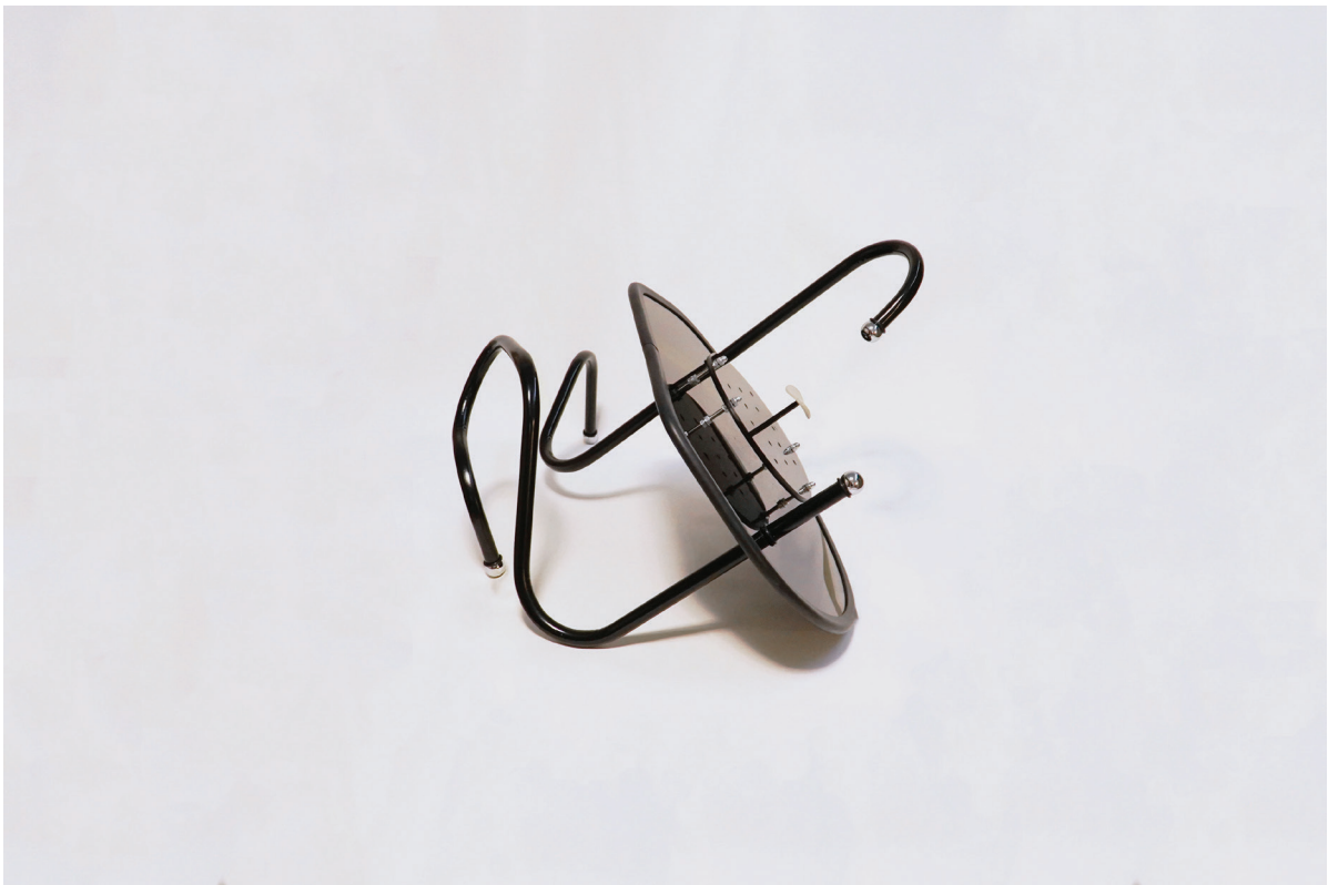
Untitled (machine), 2022, altuglas, epoxy resin, aluminium, spray paint, rubber. 70x37x50cm