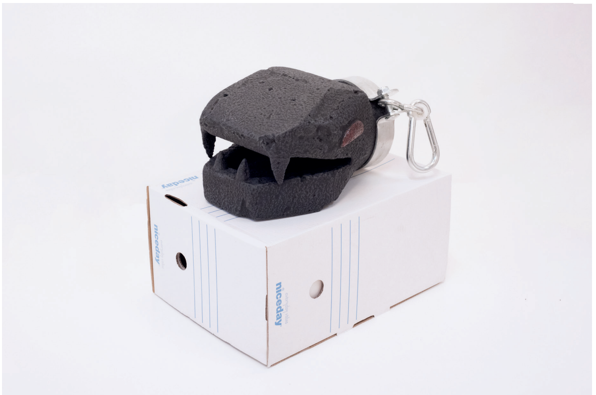
Black Snake , 2020, auto-curing putty, metal hose clamp, acrylic paint, varnish. 32x40x20cm