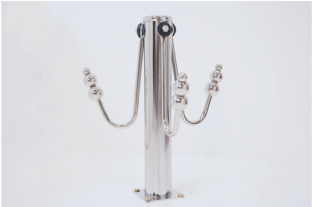
Untitled (metal) (i miss you office) , 2020, aluminium chromed, rubber seal . 50x30x27cm