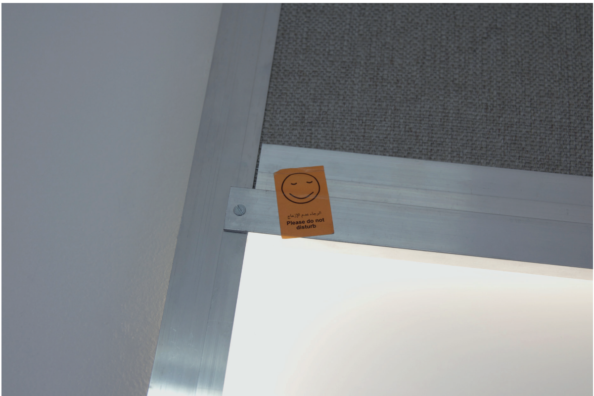
Divina Commedia (panels 1) (detail) , 2021, alluminium, wood, plexiglass, fabric, sticker. 240x240x6cm