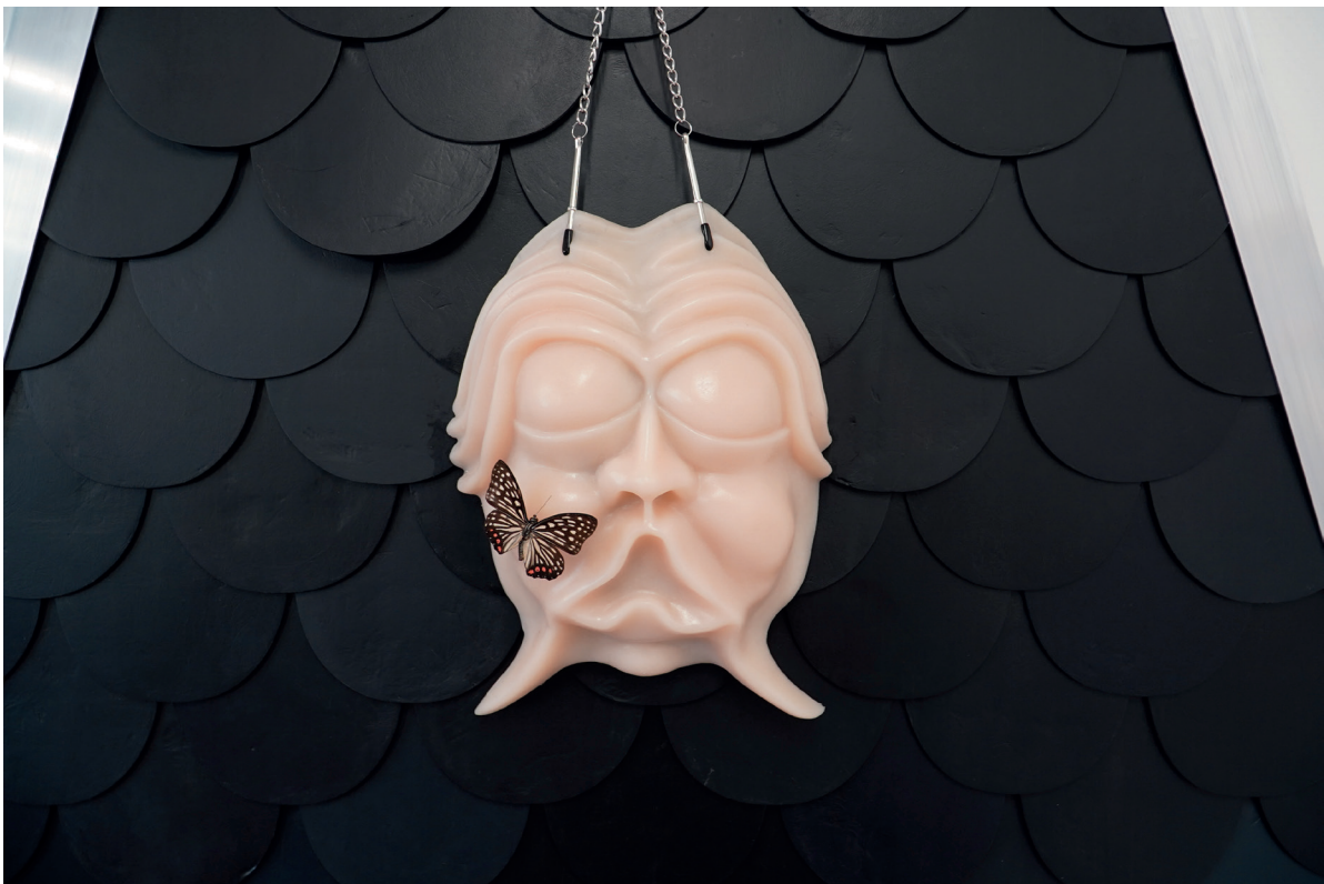
Toit + mostasu (detail), 2022

auto-curing putty, acrylic paint, varnish, aluminium, wood, silicone, nipple metal clamps, butterfly. 150x150x7 cm