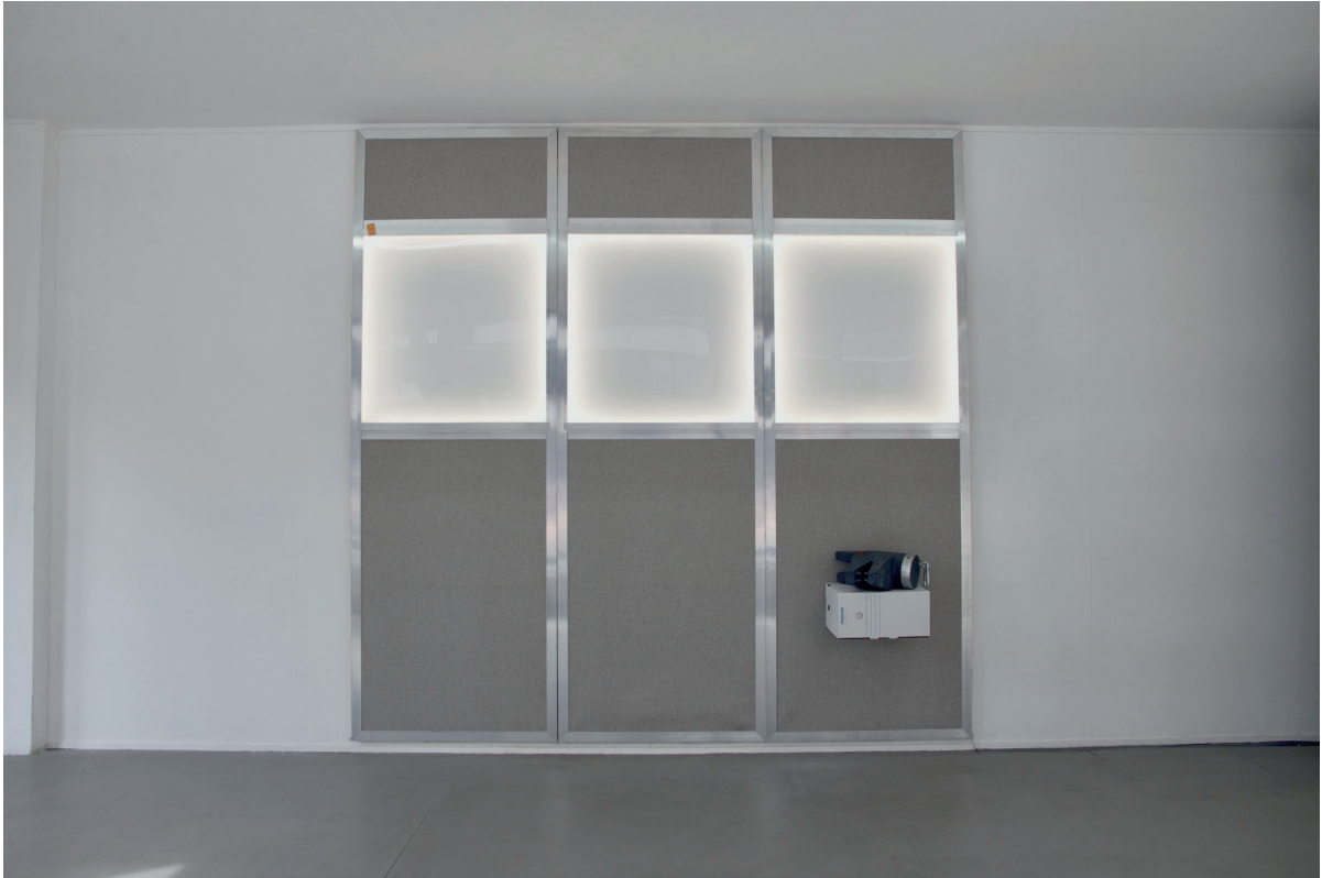
Divina Commedia (panels 1,2,3) , 2021, alluminium, wood, plexiglass, fabric, sticker. 240x240x6cm Black Dog , 2020, auto-curing putty, acrylic paint, office archive box. 30,5x31x13,5cm