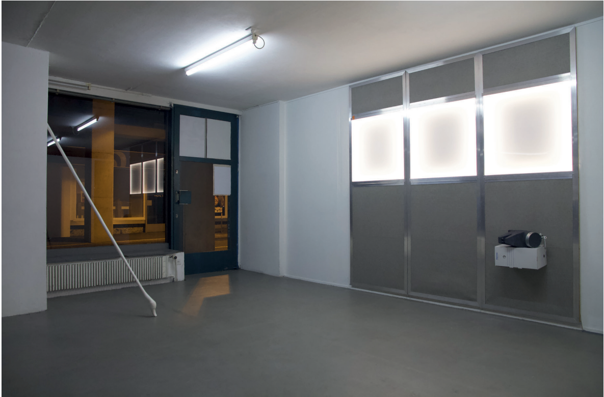
«I miss you office» , 2021, Divina Commedia, Black dog, Remigration pole (duck Face)