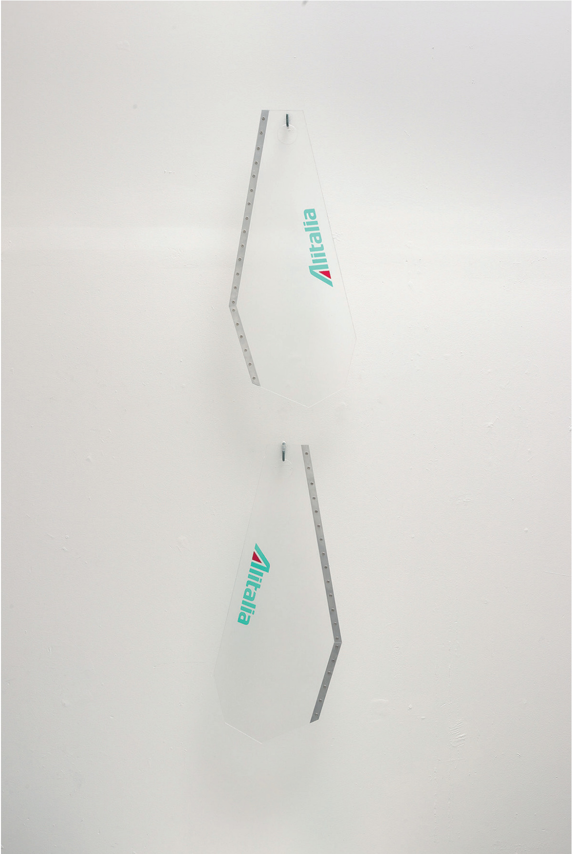
Air Con (Alitalia) (1/5), 2022, Altuglass, epoxy resin, Alluminium. 100x40x2,5 cm