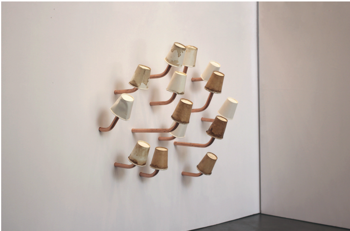
You are fired, (i miss you office) 2020, paper cups, copper, coffee, varnish. variable dimensions