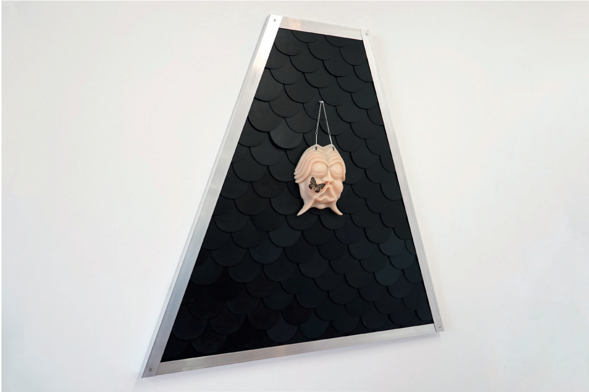
Toit + mostasu (1/3), 2022

auto-curing putty, acrylic paint, varnish, aluminium, wood, silicone, nipple metal clamps, butterfly. 150x150x7 cm