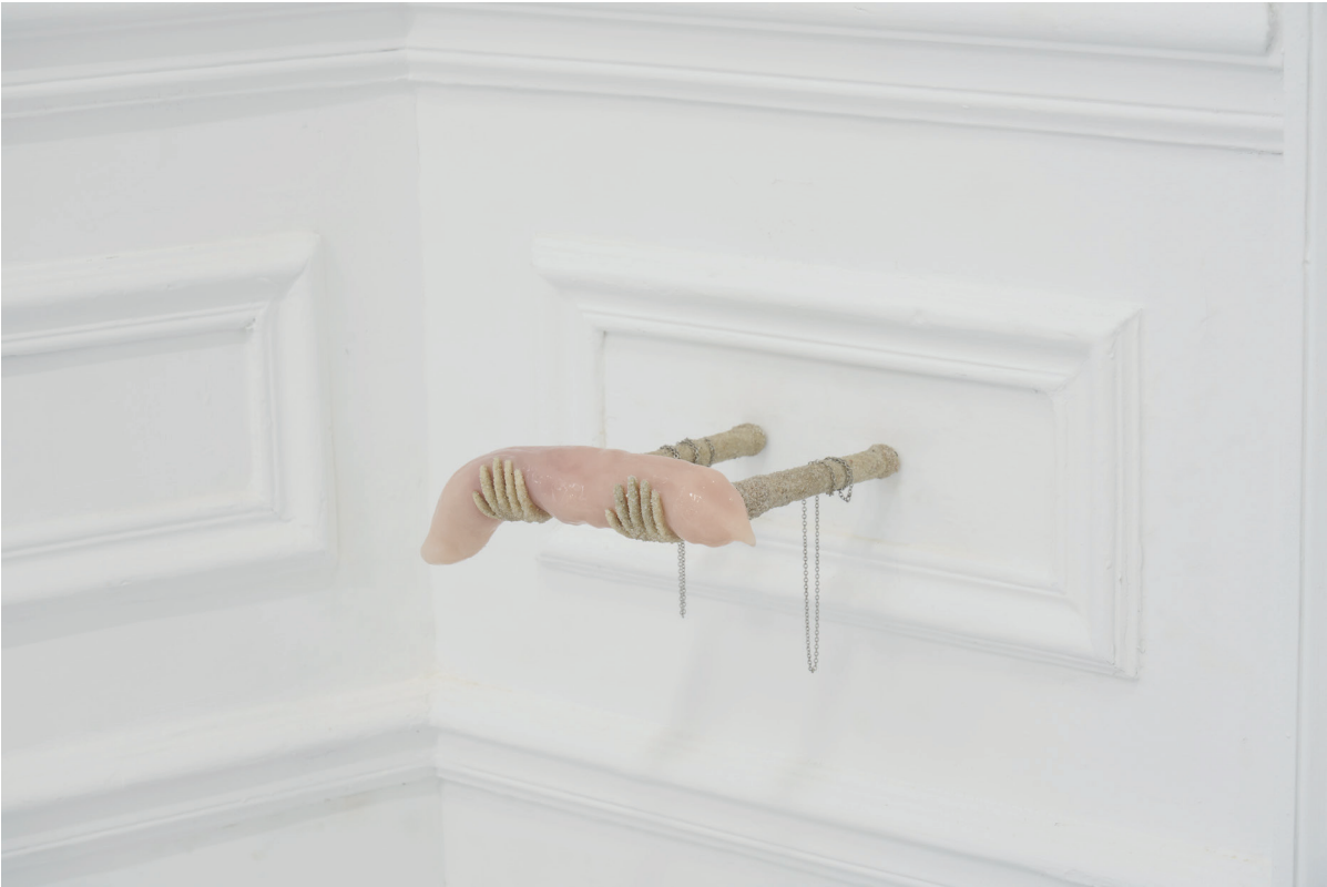
internship, (i miss you office), 2020, plastic, sand, metal, silicon. 20x20x6 cm