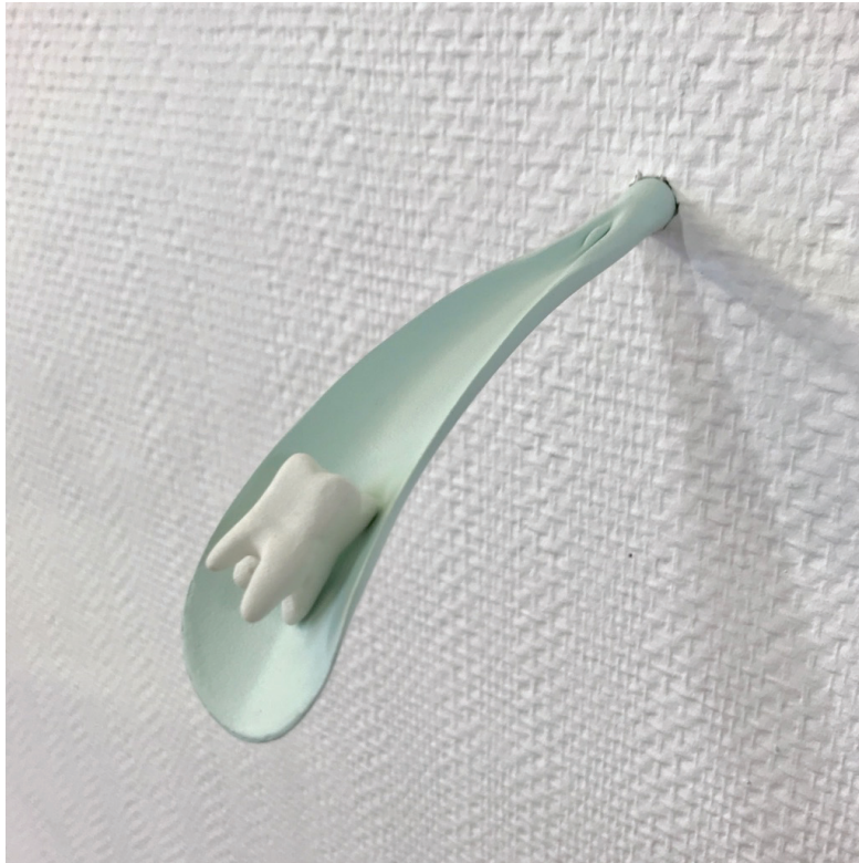
Hit me baby one more time , 2020, mineral putty, found object, paint. 15x8x7cm