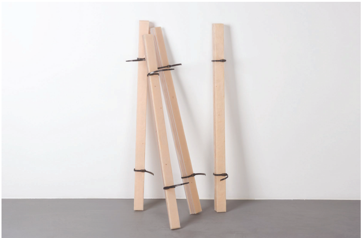
Untitled (skin) , 2017, silicone paint on Plexiglass, clamps. variable dimensions