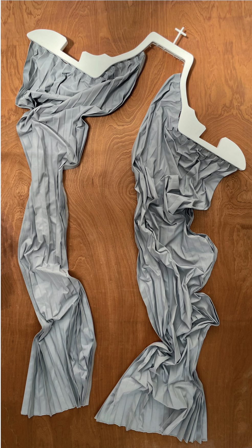
Second class, 2022

wood, aluminium, polyester putty, mineral putty, spray paint, elastomer paint, curtains. 150x218x5 cm