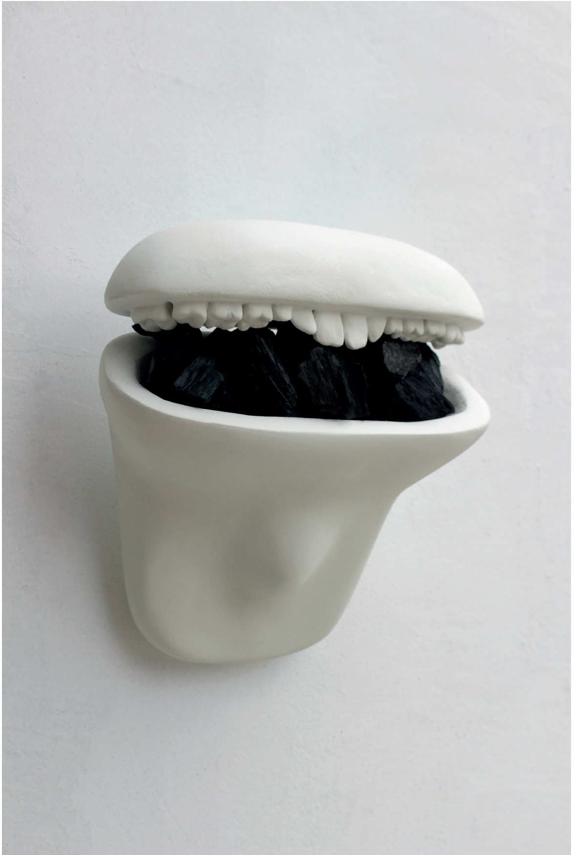
Birds of America (1/3) , 2019, auto-curing putty, paint, charcoal. 19x25x12cm