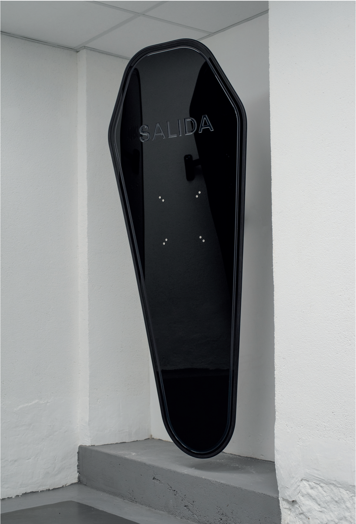
Salida I/III (detail), 2023 altuglas, epoxy resin, pigments, rubber, tv wall-mount, aluminium, sound piece. 180x67,5x1,5 cm