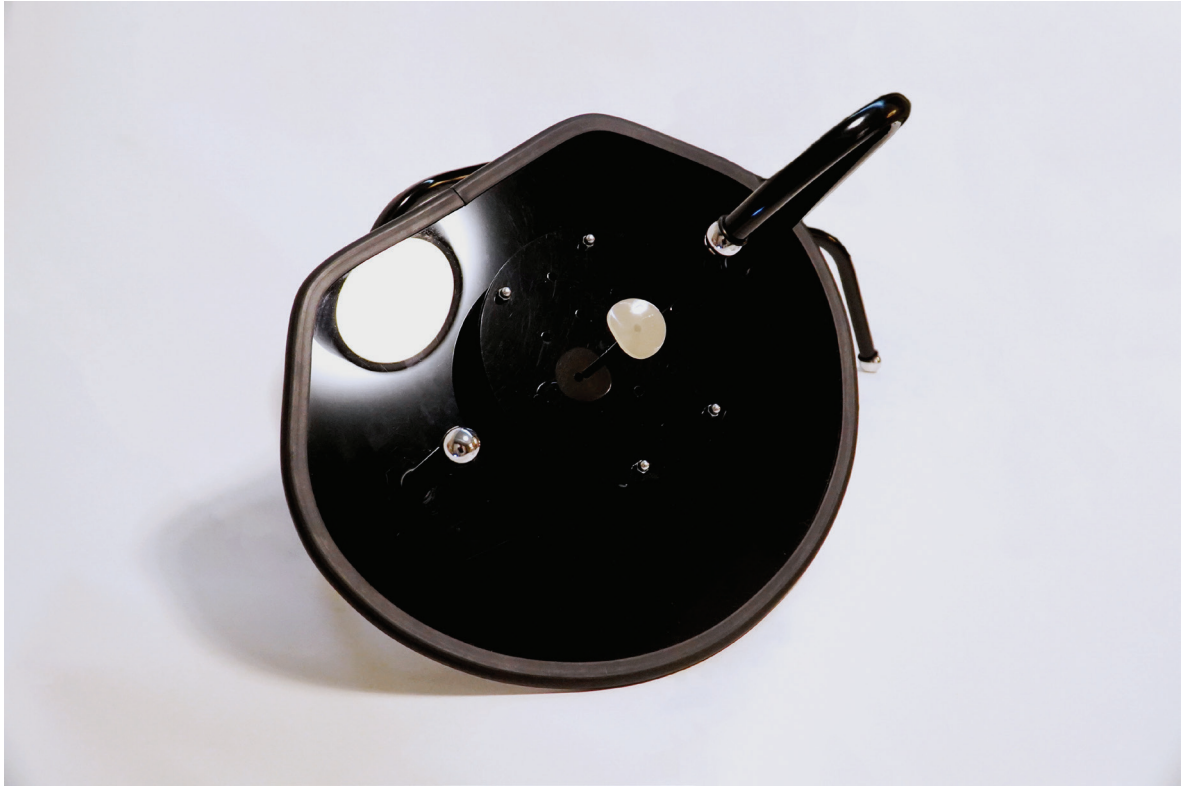
Untitled (machine), 2022, altuglas, epoxy resin, aluminium, spray paint, rubber. 70x37x50cm