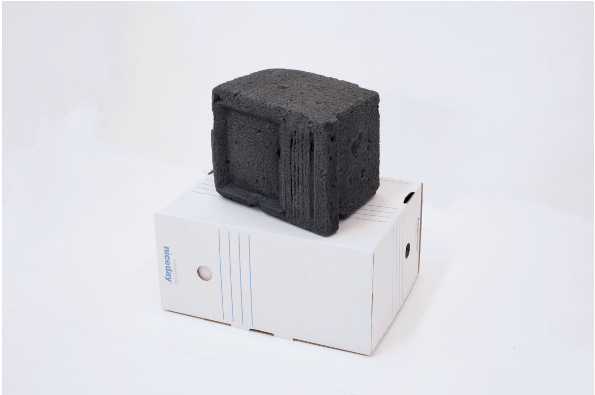
Black box , 2020, auto-curing putty, acrylic paint, office archive box. 33x42x20cm