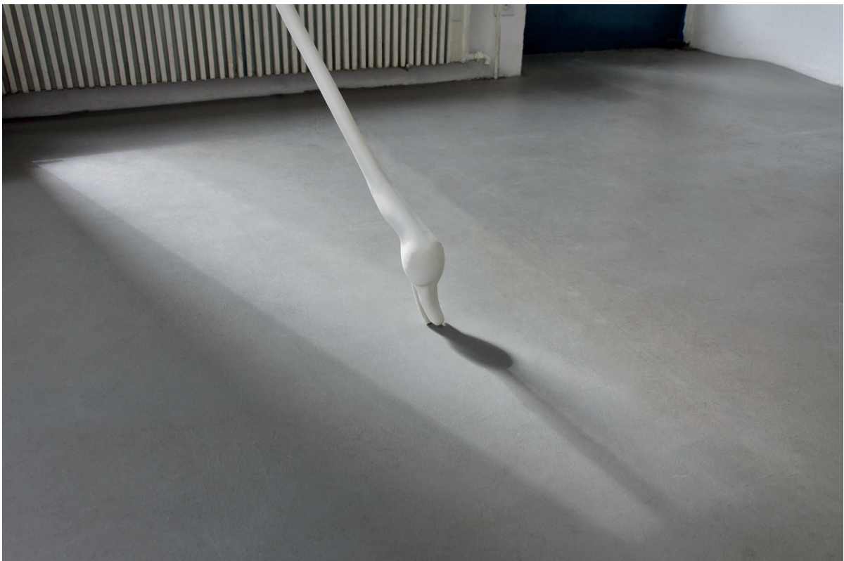
Remigration pole (duck Face) , 2021, auto-curing putty, acrylic paint. 320x27x12cm