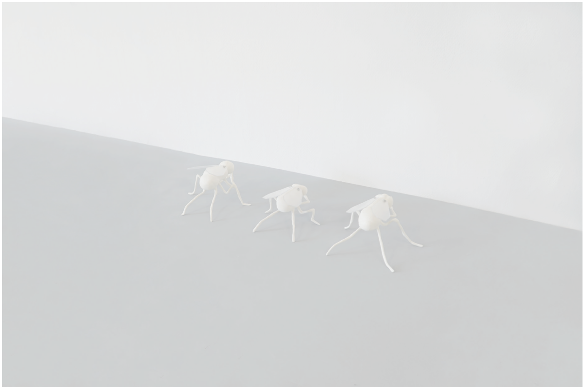
I,II,III, trois petites mouches pieuses, 2022, mineral putty, spray paint, polycarbonate, metal. Variable dimension