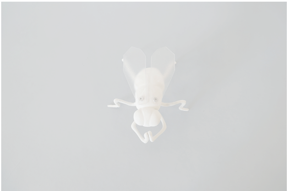
Trois petites mouches pieuses (detail I), 2022, mineral putty, spray paint, polycarbonate, metal. 22x11x15 cm