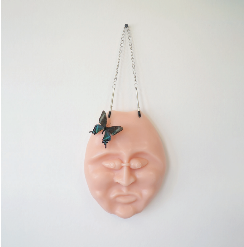
Mostasu (3/5) , 2021, silicone, nipple metal clamps, buterflie. 27x22x6 cm