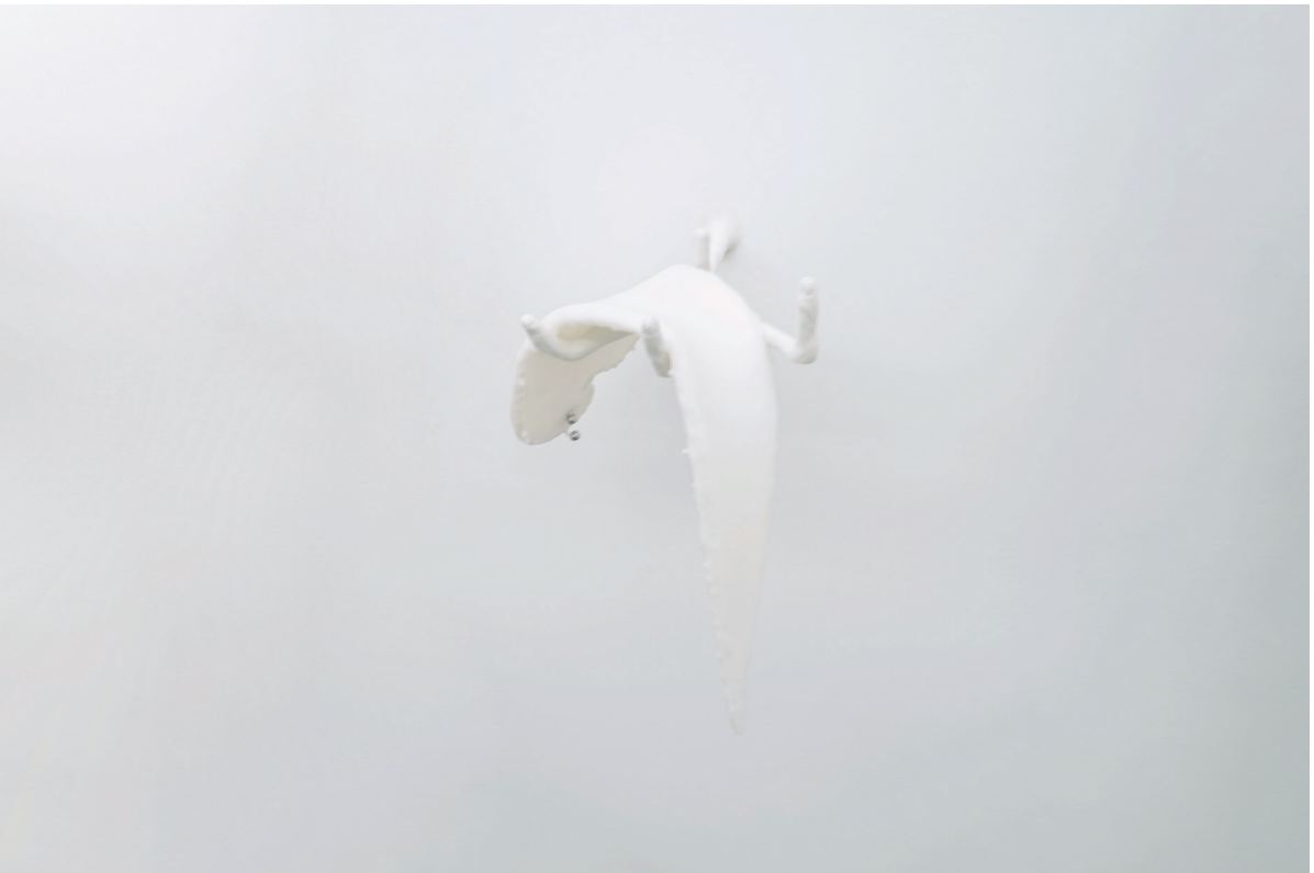
Fishing for compliments, 2022, auto curring putty, silicone, cock ring . 20x20x6 cm