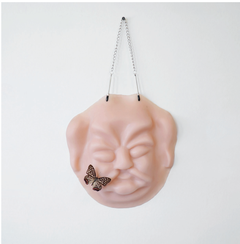
Mostasu (4/5) , 2021, silicone, nipple metal clamps, buterflie. 25x32x4 cm